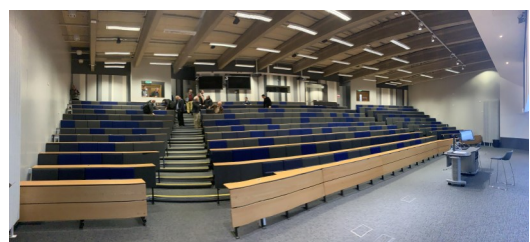
Lecture hall - Peter Chalk Centre

The excellent conference facilities at The Peter Chalk Centre in Exeter will host the lectures, Icebreaker and Conference Dinner