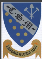
The Peter Chalk Centre