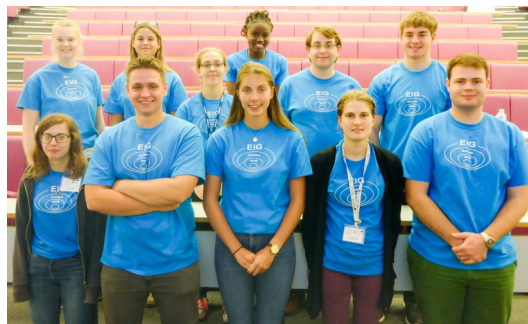
EIG 2018 Student Helpers

If any of these opportunities are of interest, please see the relevant pages of our website and contact us if the EIG committee can be of further help.