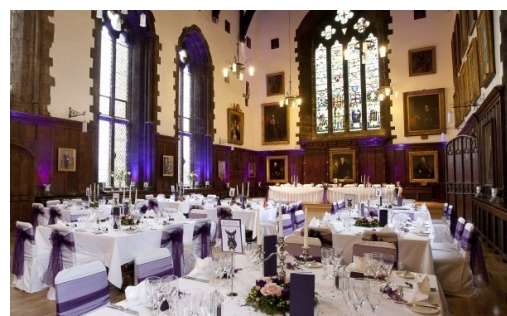
The Banqueting Hall, Durham Castle

The excellent conference facilities at Durham will include the famous Durham Castle & Banqueting Hall for the Icebreaker and Conference Dinner