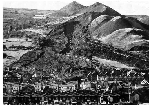
2016, the 50th anniversary of the Aberfan tip disaster